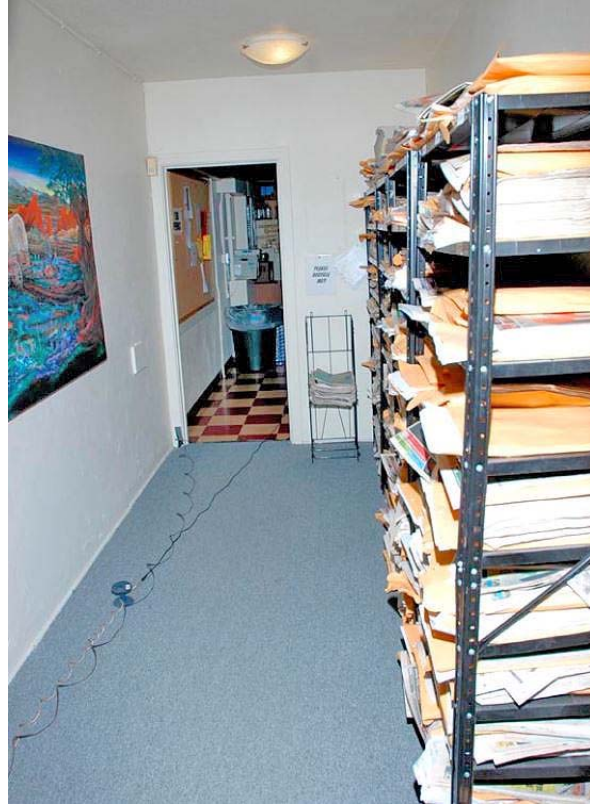
Hall leading to the breakroom

EMF readings were taken hourly at each location being monitored by video. There were no significant readings