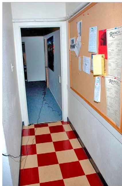
Hallway in back of building

An IT tech was working alone in the server room and felt a chill; he says that this is a common occurrence so he ignored it. However, he was the reflection of a person in a computer monitor looking at him, when he turned around it was gone. He has talked to it to see what kind of reaction he might be able to get and claims it worked but he will not let us know what he said