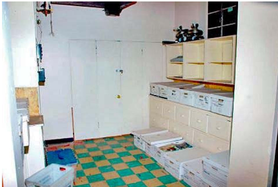
Storage area at the back of the building

It was first known as the “Tourist Memorial Church”; however, the construction had not started with the exception of a large hole, which had been dug out for the basement. The 200-member Church covered the hole with a tent and it was referred to as the “Hole in the ground Church.” Several times the tent was ripped away by high winds and the women would bring their sewing kits to repair the tent before services.