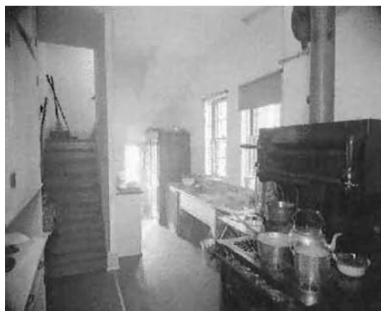
Interior views of the Press Club when it first opened