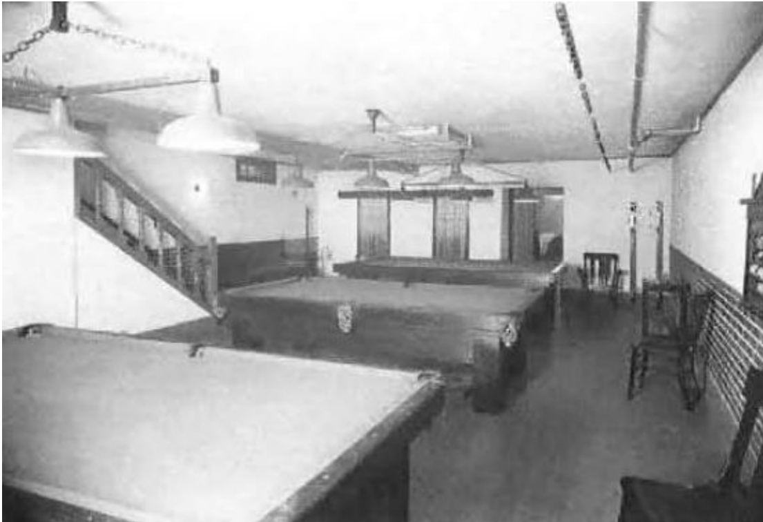
The Pool hall just after the Press Club opened

There is a story about a game of Poker that started at the Albany Hotel Press Club meetings. The story is that when the Press Club was being moved from the Hotel to the new permanent location, the Poker players refused to stop. After negotiations, the players agreed to continue their game in the back of the moving truck and continue at the new location.