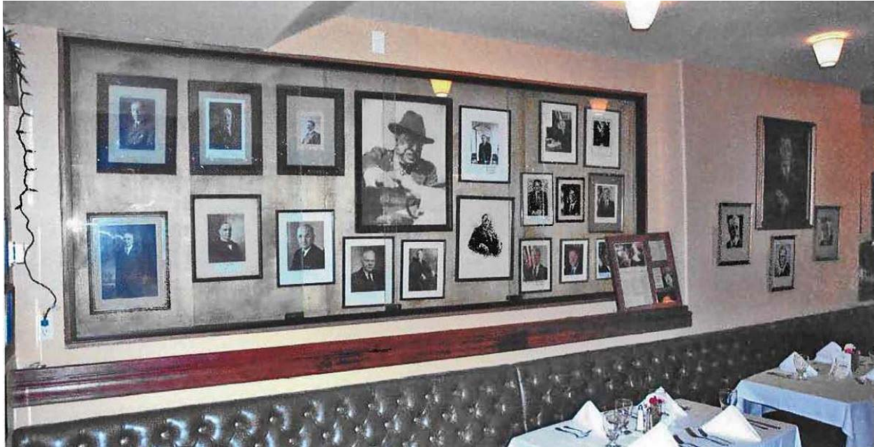
The wall of Presidents that have visited the Press Club