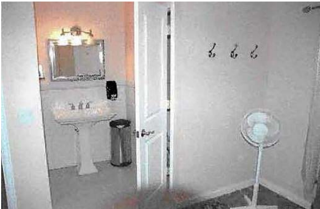
The Women's room

In July 2004, a Press Club member and high-ranking official with General Motors were at the upstairs bar after hours drinking and talking. They both claim that they witnessed a Champagne glass floated from the back of the bar to the middle of the room and fell. When it hit the floor, the glass did not break, only the stem broke.