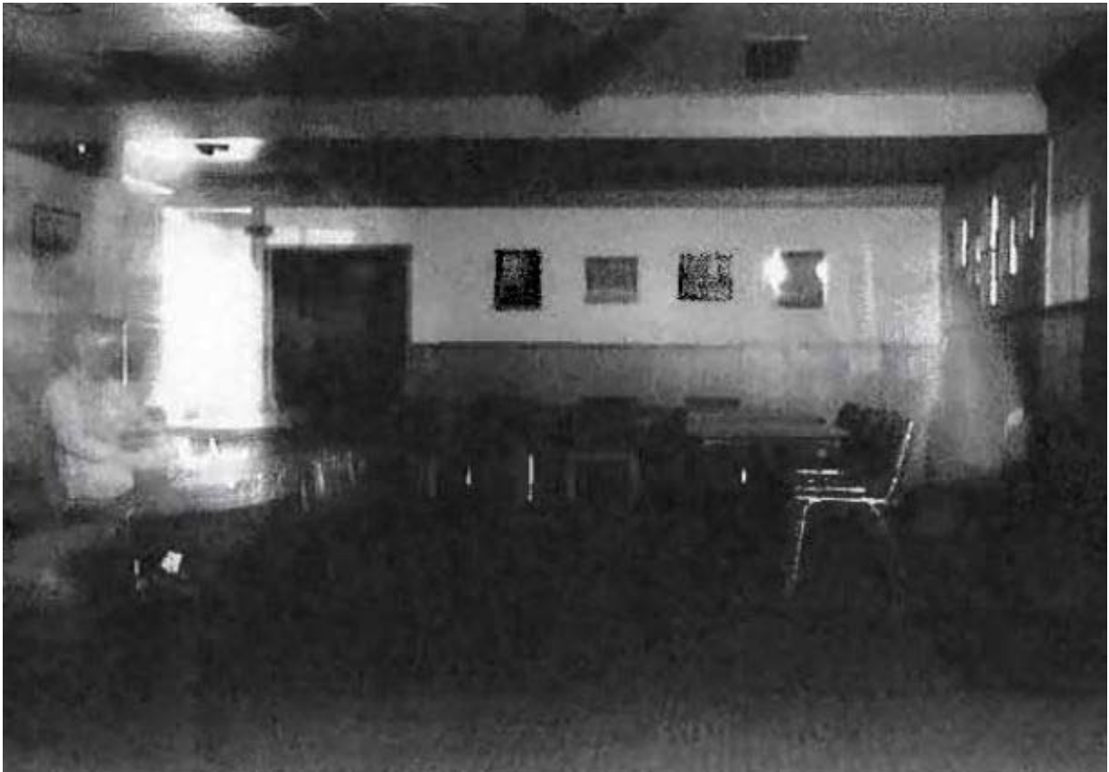
The “ghost” photo that is shown by the press club that appears to be an accidental double exposure