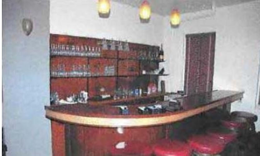
The Bar before renovations in the 2000's

The new Game room at the Glenarm location was given a custom mural featuring famous newspapermen of the time. The painting was done by Herndon Davis who is famous for the painting on the bar room floor of the Teller house in Central City.