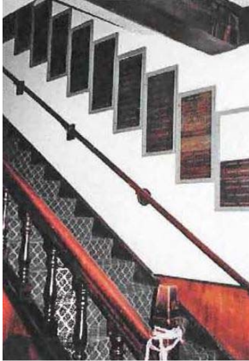
The main stairs in the 2000's

There has been reported activity in the Office on the upper floor (now the women's room) when a homeless person was killed and set on fire in the dumpster in the alley behind the Club.