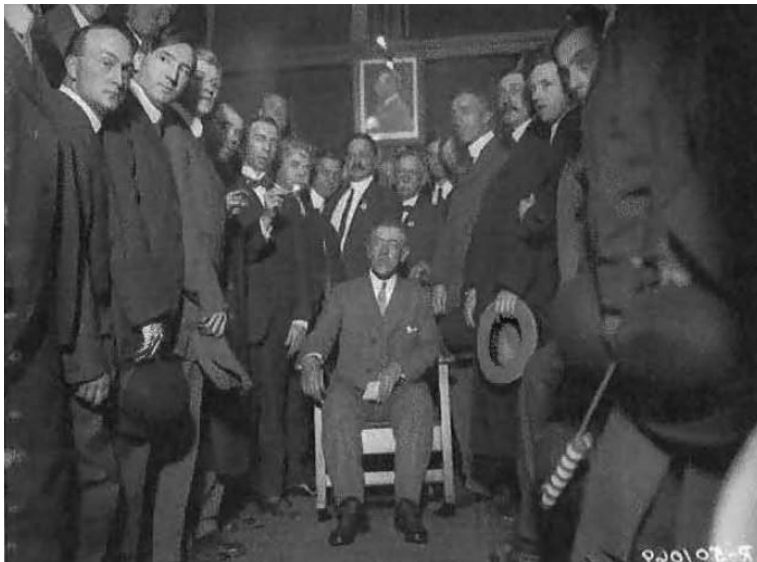
Woodrow Wilson at the Press Club

There has been reported activity in the Office on the upper floor (now the women's room) when a homeless person was killed and set on fire in the dumpster in the alley behind the Club.