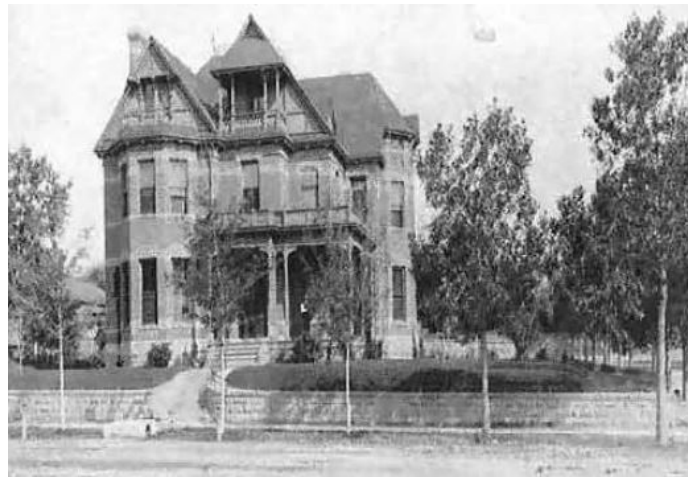
The Women's Press Club

was $50,000. The Denver Landmark Preservation Commission honored the location by giving it the designation of a Historic Location.