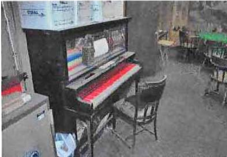
The piano that was reported to have played by itself

Guests have reported seeing the reflections of people that were not in the room.