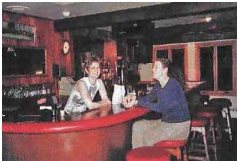
The bar in the early 2000's