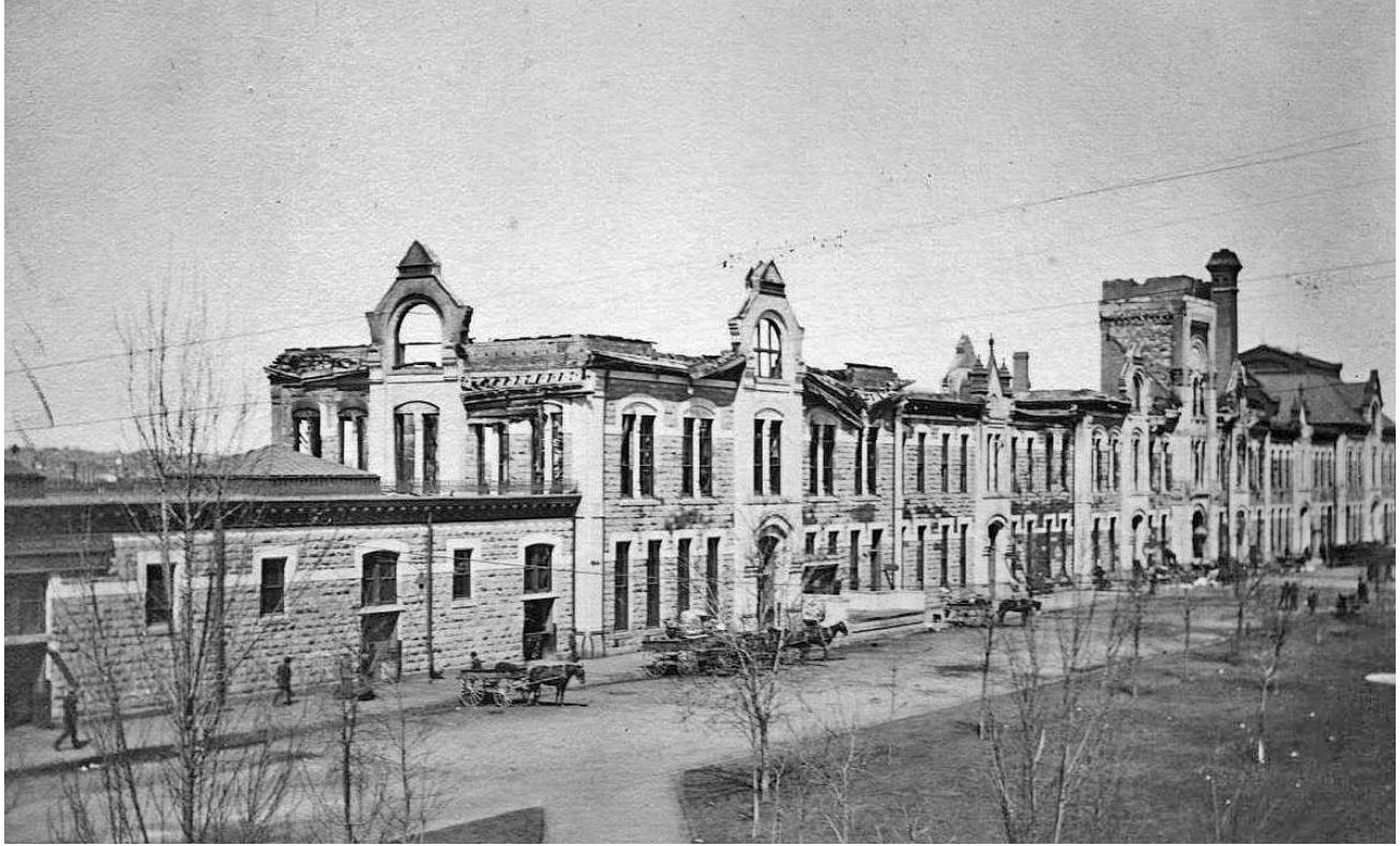
After the fire

There used to be a huge welcoming arch that was built in 1906. It read "MIZPAH" (Hebrew for welcome) on one side and "Welcome" on the other. The arch was dismantled in 1931 as a traffic hazard.